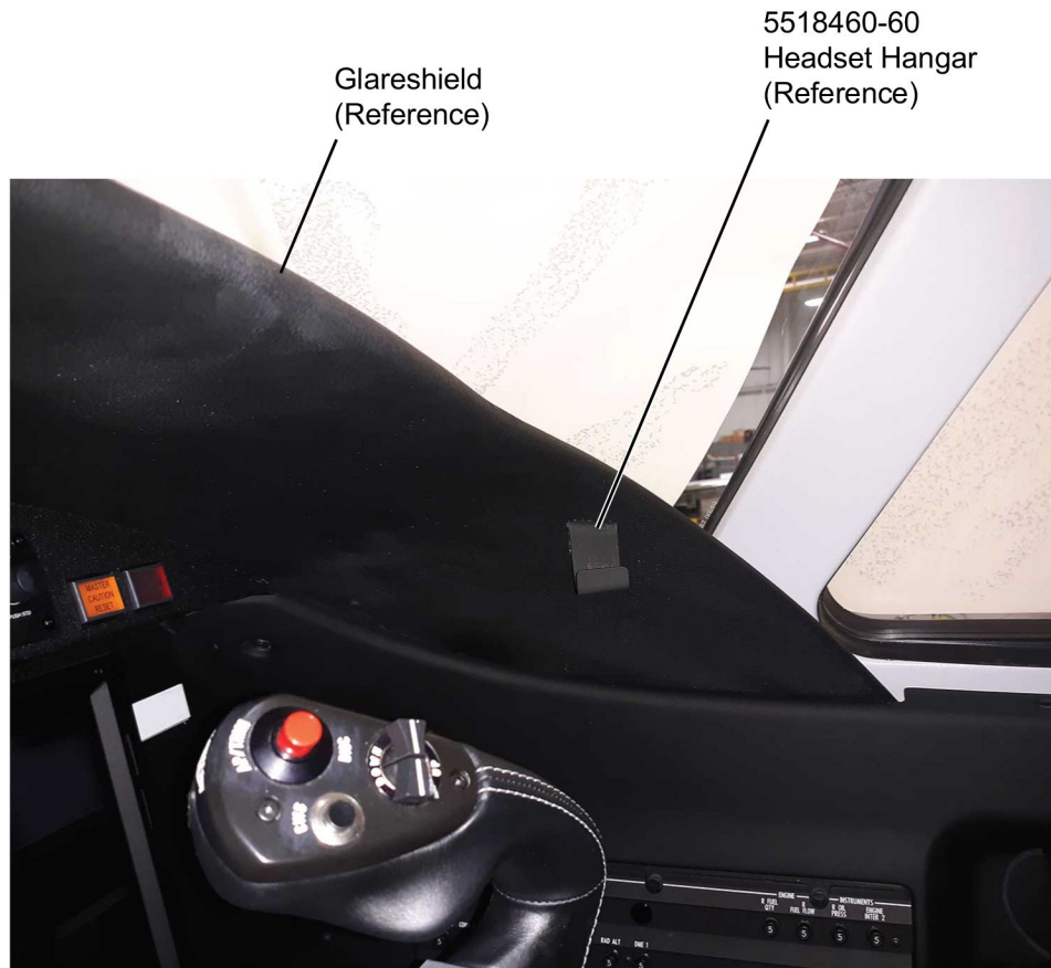
DETAIL A Right Side Shown, Left Side Typical