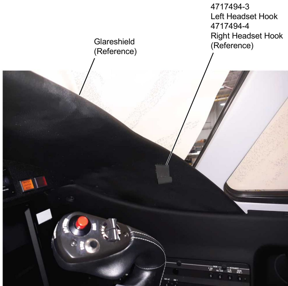
DETAIL A Right Side Shown, Left Side Typical